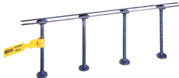
FIGURE 1—SCHÖCK BOLE SR STUD RAILS

SCHÖCK USA, INC. 281 WITHERSPOON STREET SUITE 110 PRINCETON, NEW JERSEY 08540 (855) 572-4625 www.schoeck.com